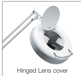
Hinged Lens cover