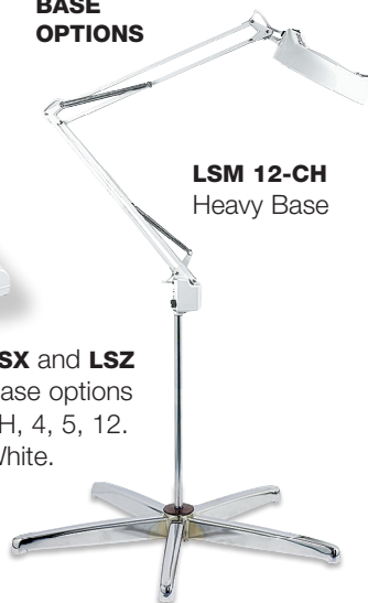
LSM 12-CH Heavy Base

LSX and LSZ Base options 3H, 4, 5, 12. White.