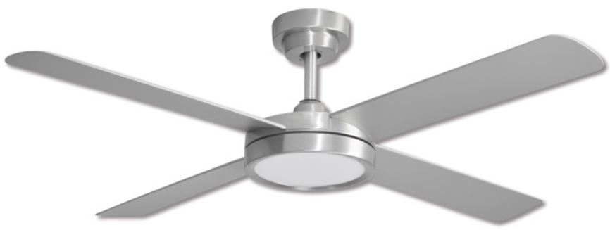
PL3207 BRUSHED ALUMINIUM

With matt black polymer blades 132cm (52")