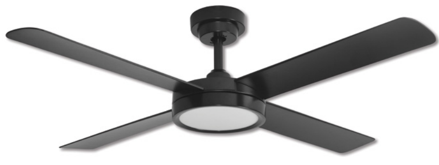
PL3206 MATT BLACK

With matt black polymer blades 132cm (52")