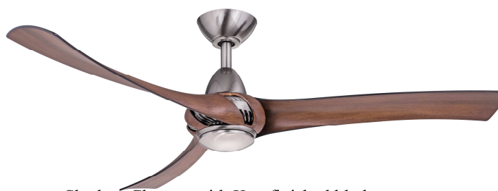
Shadow Chrome with Koa finished blades