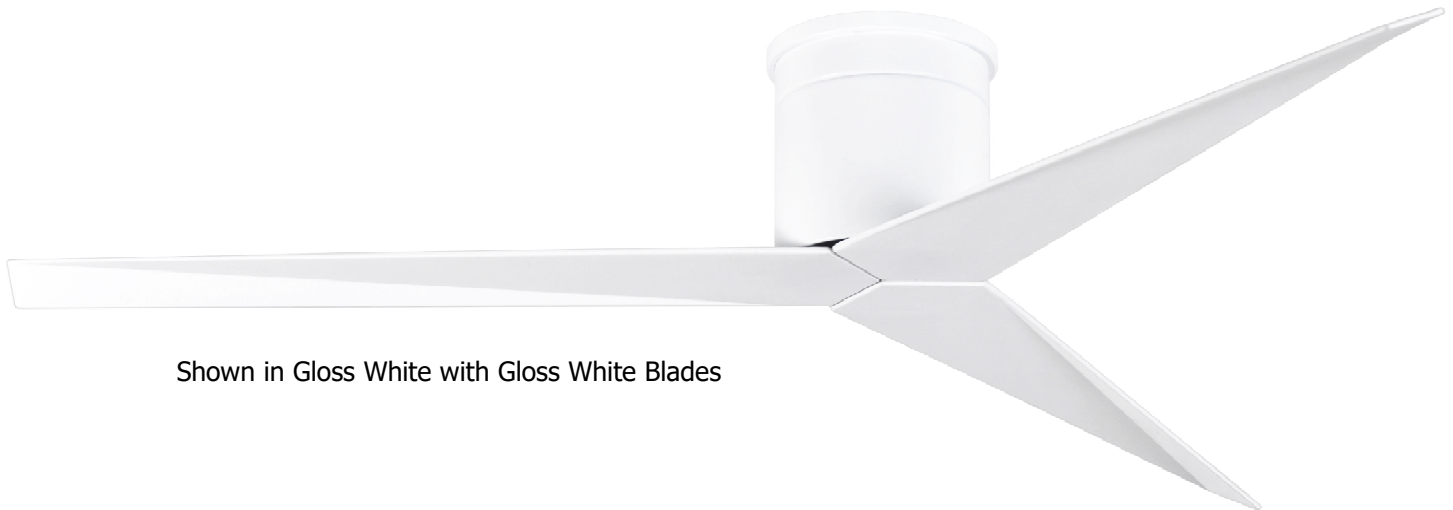
Shown in Gloss White with Gloss White Blades

Designed by Chicago architect Stephen Katz in 2013, the wet location Eliza-H blends a beautiful technically derived form with superior function and movement. The unique blade shape is designed to maximise air movement at the outer edge of the blade. The result is more efficient air velocity rings, less blade drag and a greater motor optimisation. Equally important is Eliza'-Hs stationary visual statement which combines modern utility with minimalist geometry. Constructed of cast aluminium and heavy stamped steel, the Eliza-H has a limited lifetime warranty.