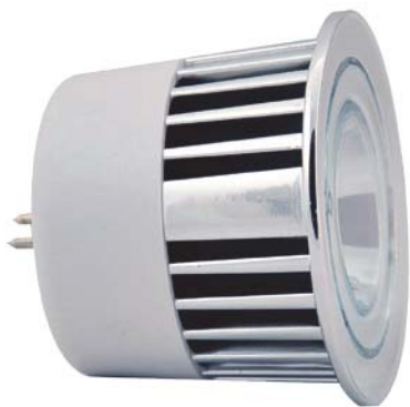
RGB, 5w LED