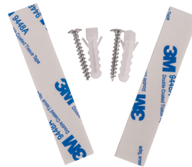
Supplied with Double Side tape and Screws