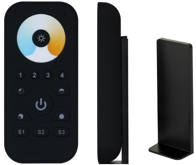
Wall Mounting Bracket