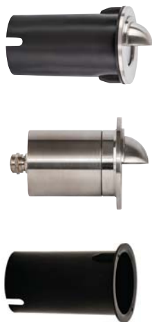
Cutout with Canister