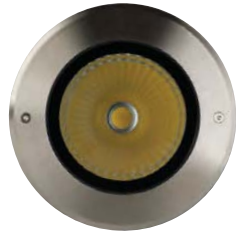
Optional face with screws. Sold separately