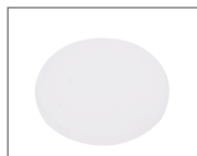
Opal Diffuser (Optional) Variant: 10167