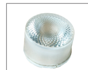
60° Lens (Optional) Variant: 10171