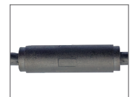
Water Stop Cable Joint