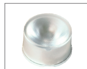
19° Lens (Optional) Variant: 10169