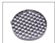
Honeycomb (Optional) Variant: 10173