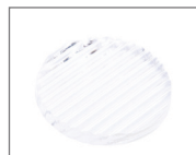
Linear Lens (Optional) Variant: 10168