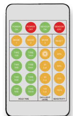
PECELL Remote Control PIR Remote Control