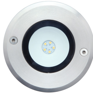
Vienta Round Uplight CIG7860