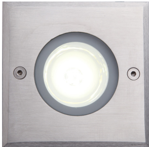
Vienta Square Uplight CIG7830

Compact in design & highly efficient, this light is perfectly suitable for decks & pathways.