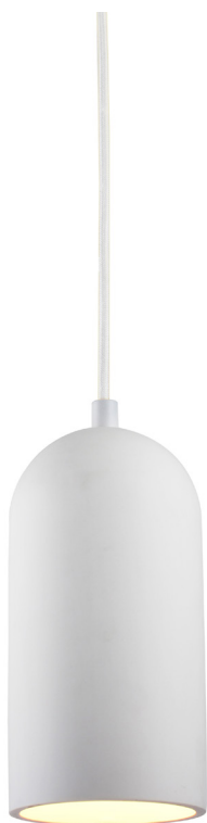
White Stone Cylinder CIDP607163

The Cylinder pendant has a classic shape and neutral tone to complement any style of interior and colour palette. This pendant brings an urban edge to your decor with its texture and form.