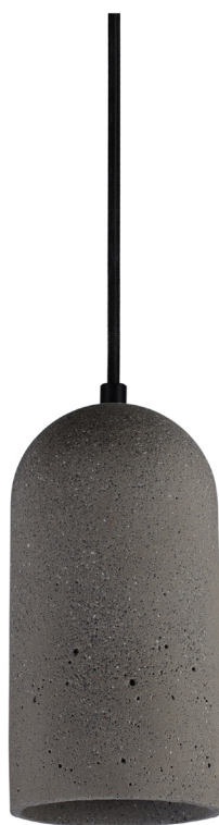
Sandstone Cylinder CIDP607164