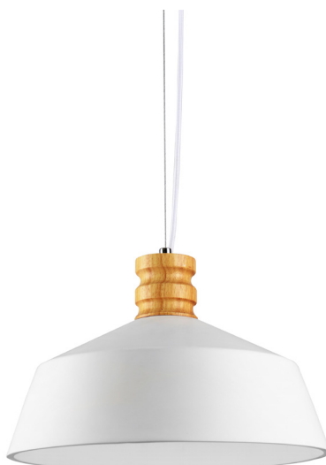
Billie White CIDP603161