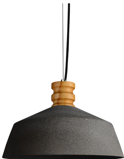
Billie Sandstone CIDP603162

The Crompton Billie pendant features a classic design with a detailed wooden trim. The large bowl shade provides great ambient light for living and dining areas.