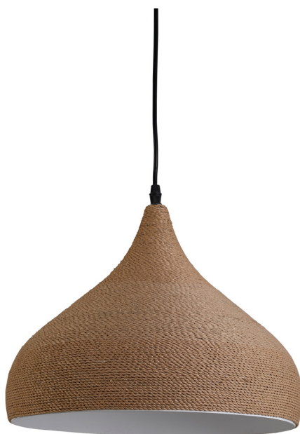
Anja Round CIDP503162