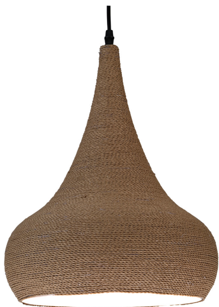
Anja Tear Drop CIDP503163

The organic shape of the Anja pendants compliments its natural woven string and metal materials. The soft formation of the shape combined with the woven finish add both texture and warmth to your space.