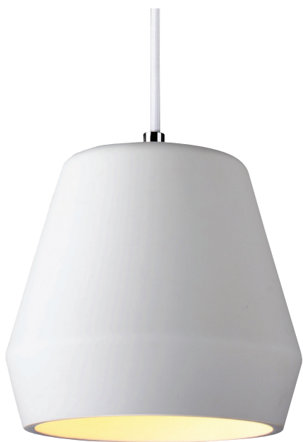
Accord White CIDP608161

Minimalist and classic pendant that is shaped for total flexibility of use within the home. The Accord looks great hung in a continuous line above a bench and a bench and is a perfect alternative to a bedside lamp.