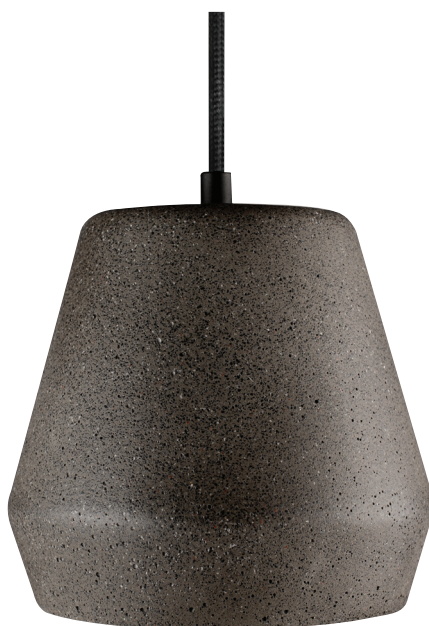
Accord Black CIDP608162