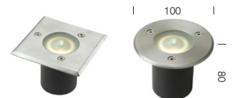
Terre square ground light 20w MR16

Colours: 304 stainless steel with frost glass.