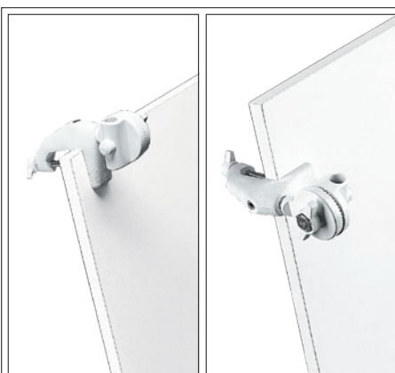
Showing LSM-1 fitting on top and side of drawing board

LSM-12 Floor stand with 300mm rod, overall height 340mm, 660mmØ base suitable for MODEL LSZ and LSX lamps.