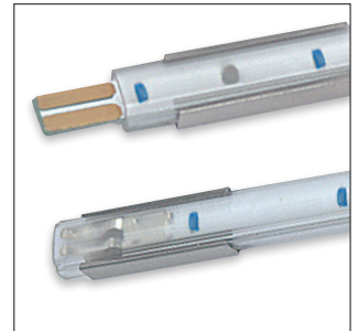
Close up showing Connecting ends and discreet mounting clips