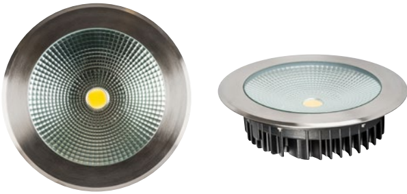
Cutout with Canister Ø236