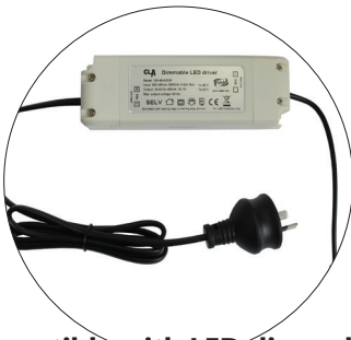
Compatible with LED dimmable driver: CM-40VADDR