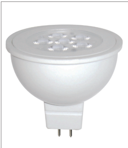
MR1601 & MR1602