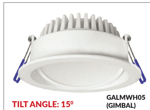
TILT ANGLE: 15°