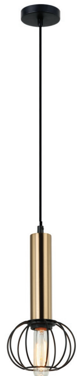
CORAZON2 (antique brass/ matt black cage round)