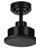
MOTOR Matt Black