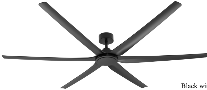
Black with Matt Black Blade