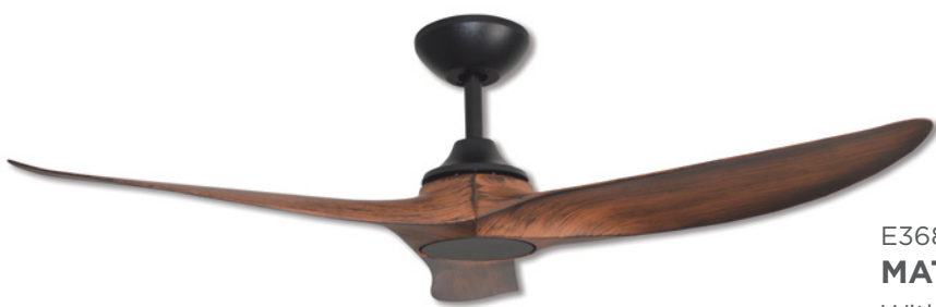
E368 MATT BLACK WITH KOA

With matt black polymer blades 152cm (60")