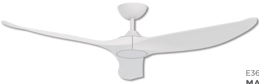
E366 MATT WHITE

With matt white polymer blades 152cm (60")