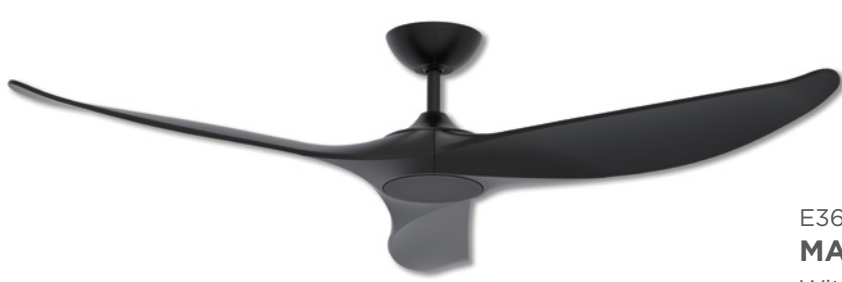
E367 MATT BLACK

With matt black polymer blades 1520mm (60")