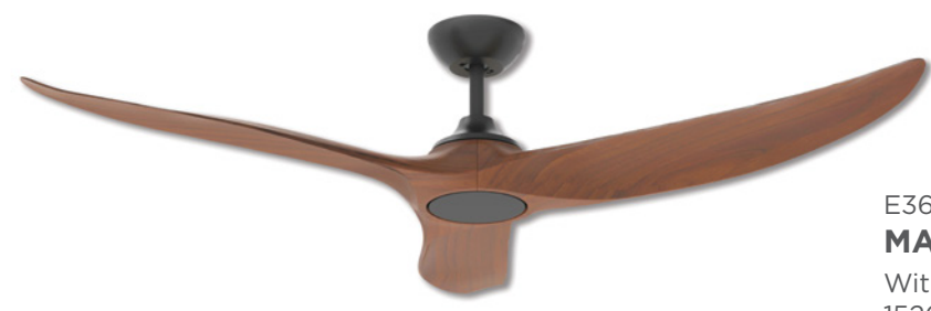
E368 MATT BLACK WITH KOA

With matt black polymer blades 1520mm (60")