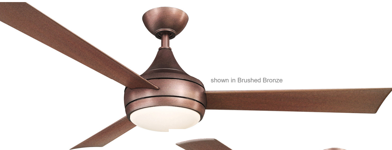
shown in Brushed Bronze

With teardrop motor housing, the 52" Donaire 316 marine grade stainless steel coastal wet location ceiling fan is transitional in design. Donaire is finished in brushed bronze or brushed stainless, equipped with ABS blades and 16W LED dimmable light kit with optional metal cover. Constructed of entirely 316 marine grade stainless steel, the Donaire carries a limited lifetime warranty.