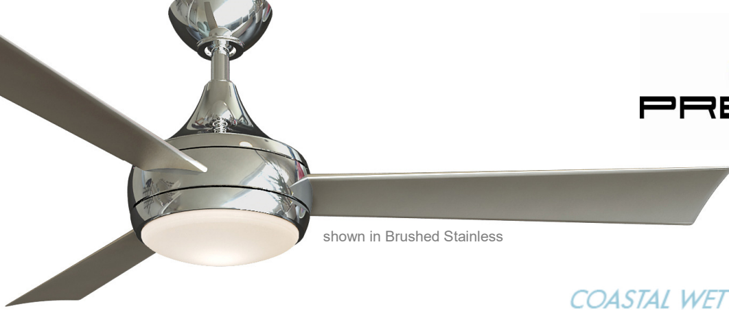
shown in Brushed Stainless