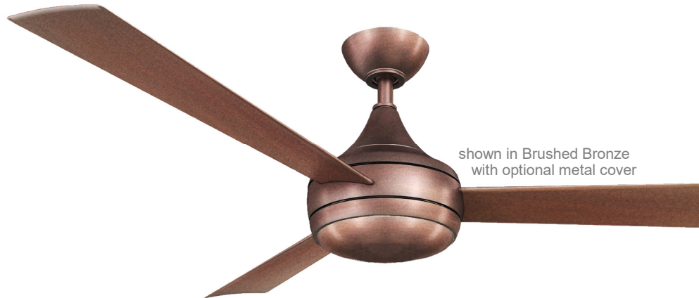
shown in Brushed Bronze with optional metal cover