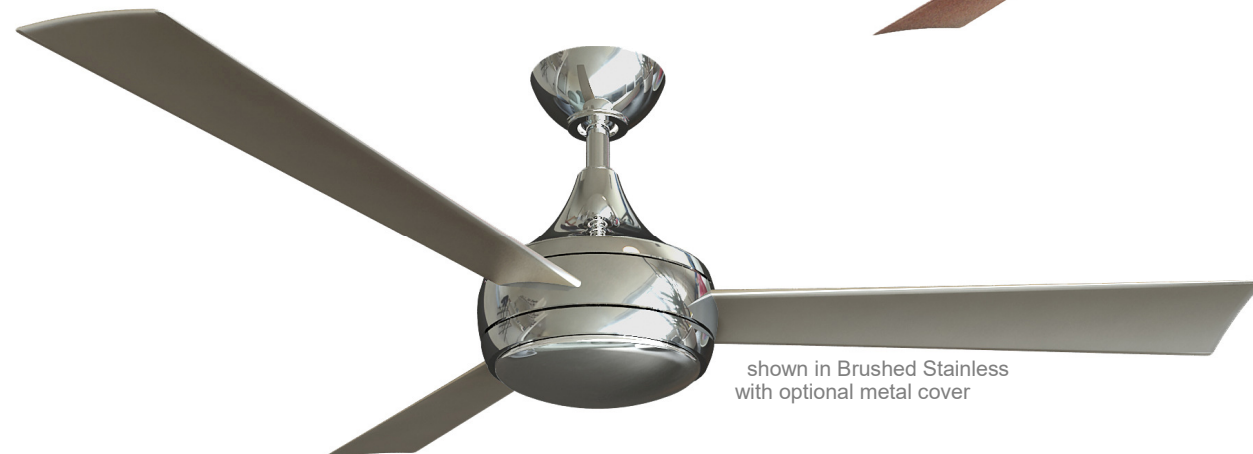
shown in Brushed Stainless with optional metal cover