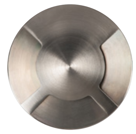
Single Inground HV19062T