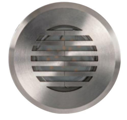
Inground with grill HV19102T