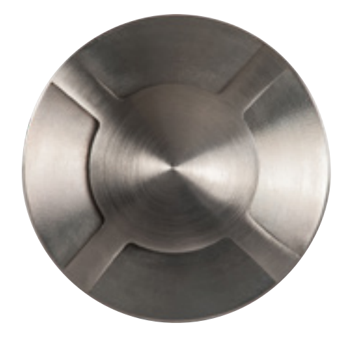
Four-way Inground HV19092T