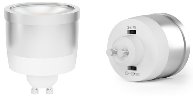
HV9506D & HV9506