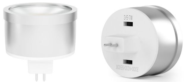
HV9507 & HV9508