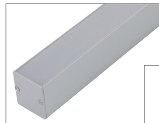
Brushed Aluminium Finish