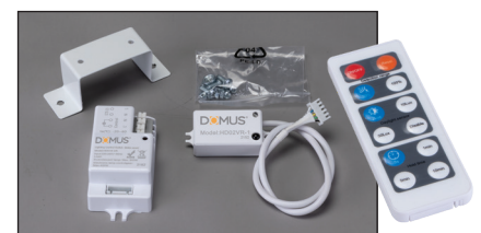
Internal ON/Off Sensor