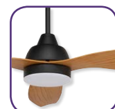
MATT BLACK WITH MAPLE TIMBER BLADES