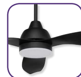
MATT BLACK WITH WHITE BLADES