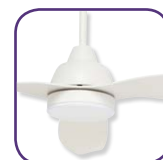
MATT WHITE WITH WHITE BLADES