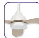
MATT WHITE WITH WHITEWASHED TIMBER BLADES