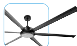
Model shown with Lightkit installed