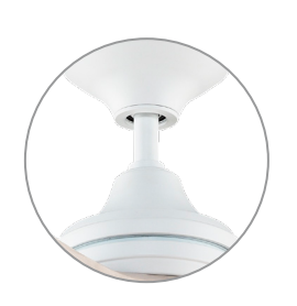
MS21MW Spitfire 2 motor in Matte White