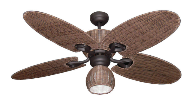
MHF134OB (w/ MHLKOB)