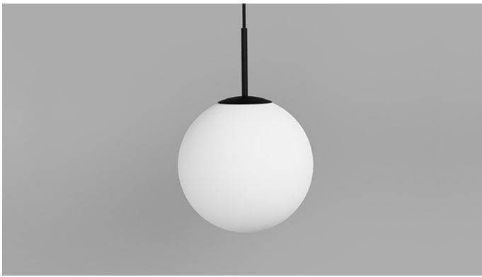
Large / Textured Black LR.i02.55.L.BL