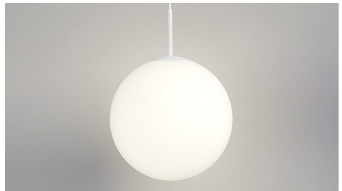
Extra Large / Textured White LR.i02.55.XL.WH