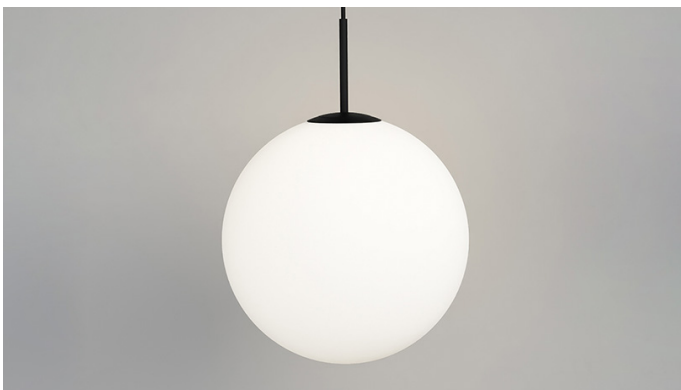
Extra Large / Textured Black LR.i02.55.XL.BL