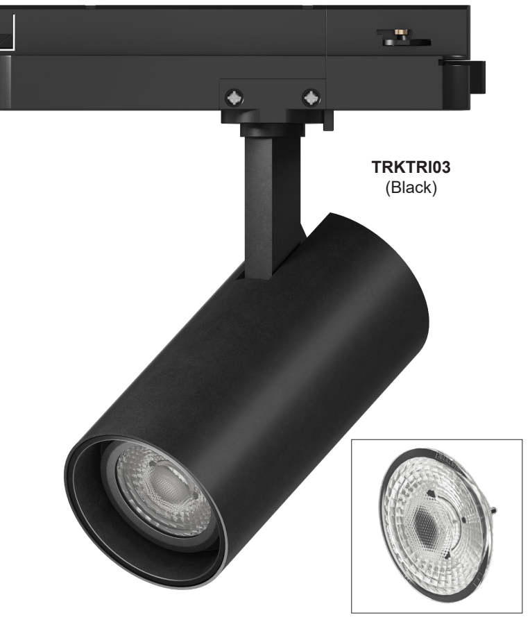
Additional 60° lens is included in the package