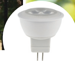
Recommended globes: CLAL36A & CLAL37A