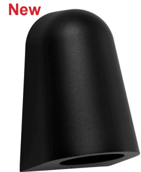
TORQUE5 (GU10) TORQUE6 (MR16) (Black)