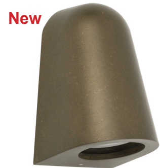
TORQUE9 (GU10) (Aged Brass)