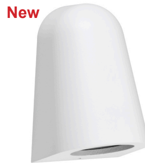
TORQUE7 (GU10) TORQUE8 (MR16) (White)