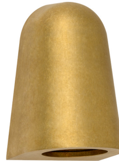
TORQUE3 (GU10) TORQUE4 (MR16) (Antique Brass)