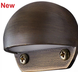
STE27 (Brush Finish)