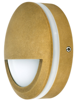
STE19 & 20 (Antique Brass)