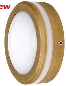
STE21 & 22 (Antique Brass)