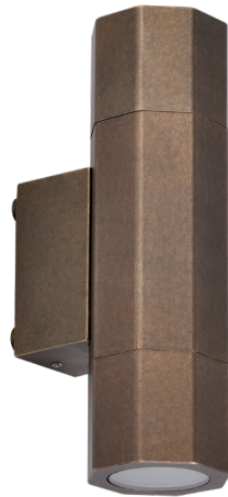
OCTO1 (Aged Brass)