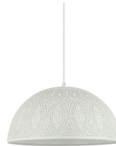
MARRAKESH08 (Dome Shape)