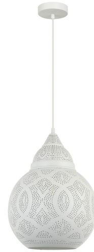
MARRAKESH06 (Bell Shape)