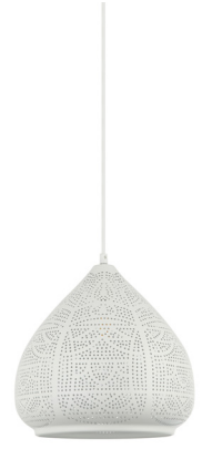
MARRAKESH07 (Ellipse Shape)