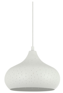
MARRAKESH09 (Champagne glass Shape)