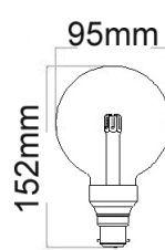
G95 Line drawings