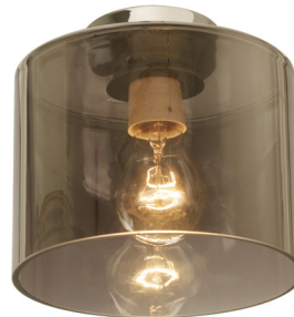
DIYBAT20 (Chrome / Smoky Glass)