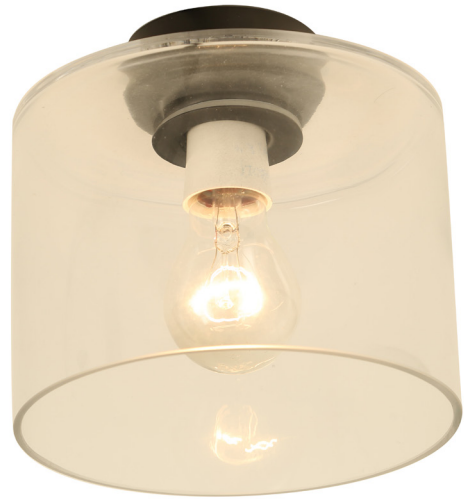
DIYBAT17 (Black / Clear Glass)