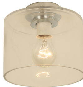
DIYBAT18 (Chrome / Clear Glass)