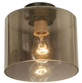
DIYBAT19 (Black / Smoky Glass)