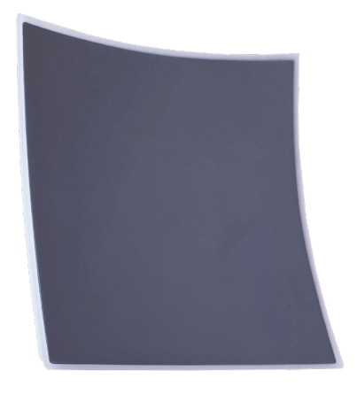
CRISTAL1 (Dark Grey)