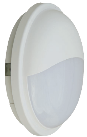
BULK16 & 18