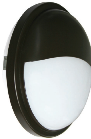
BULK15 & 17