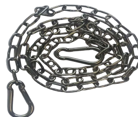
1Meter 304 Safety Chain